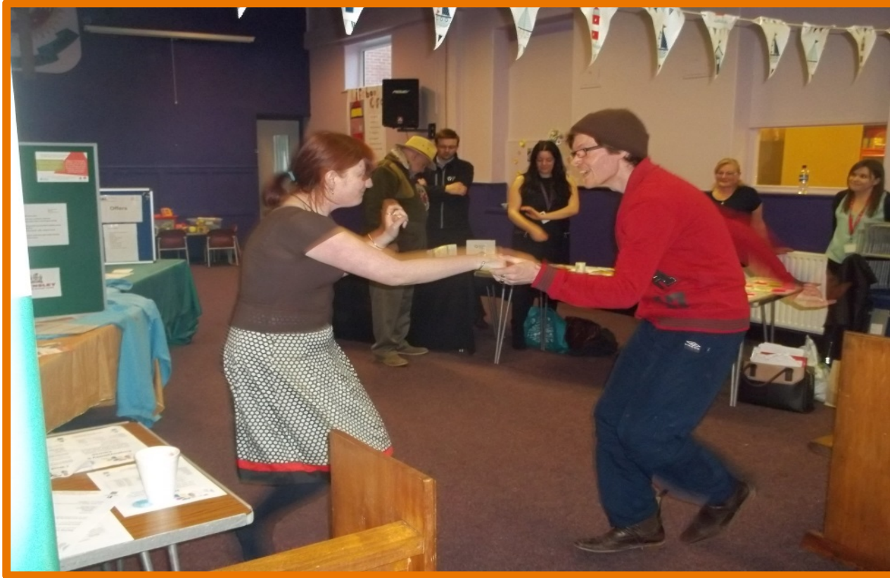
hOurbank members sharing the skill of Lindy Bop dancing