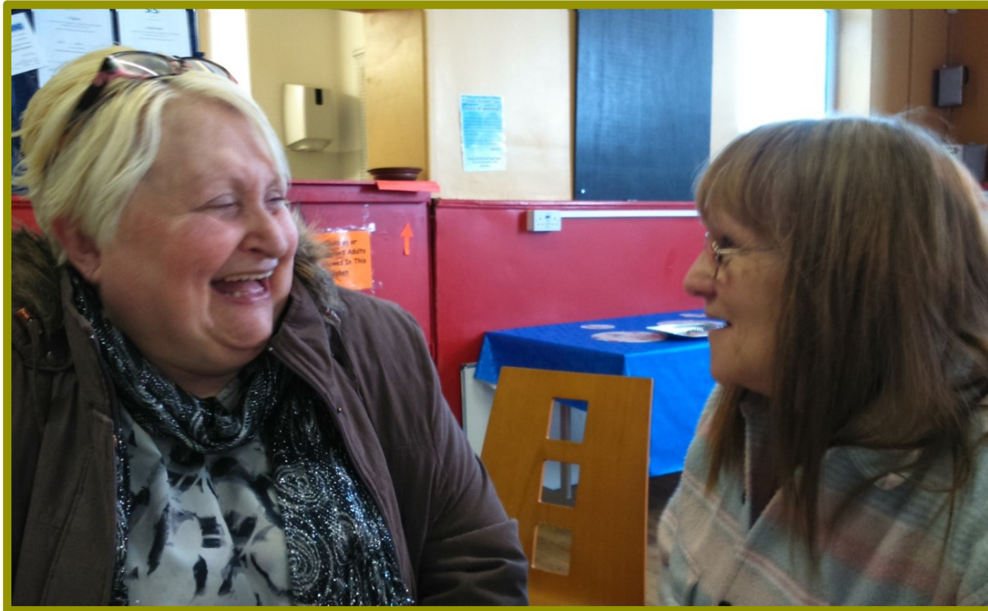
Members enjoying company and chat at the regular coffee meet-ups